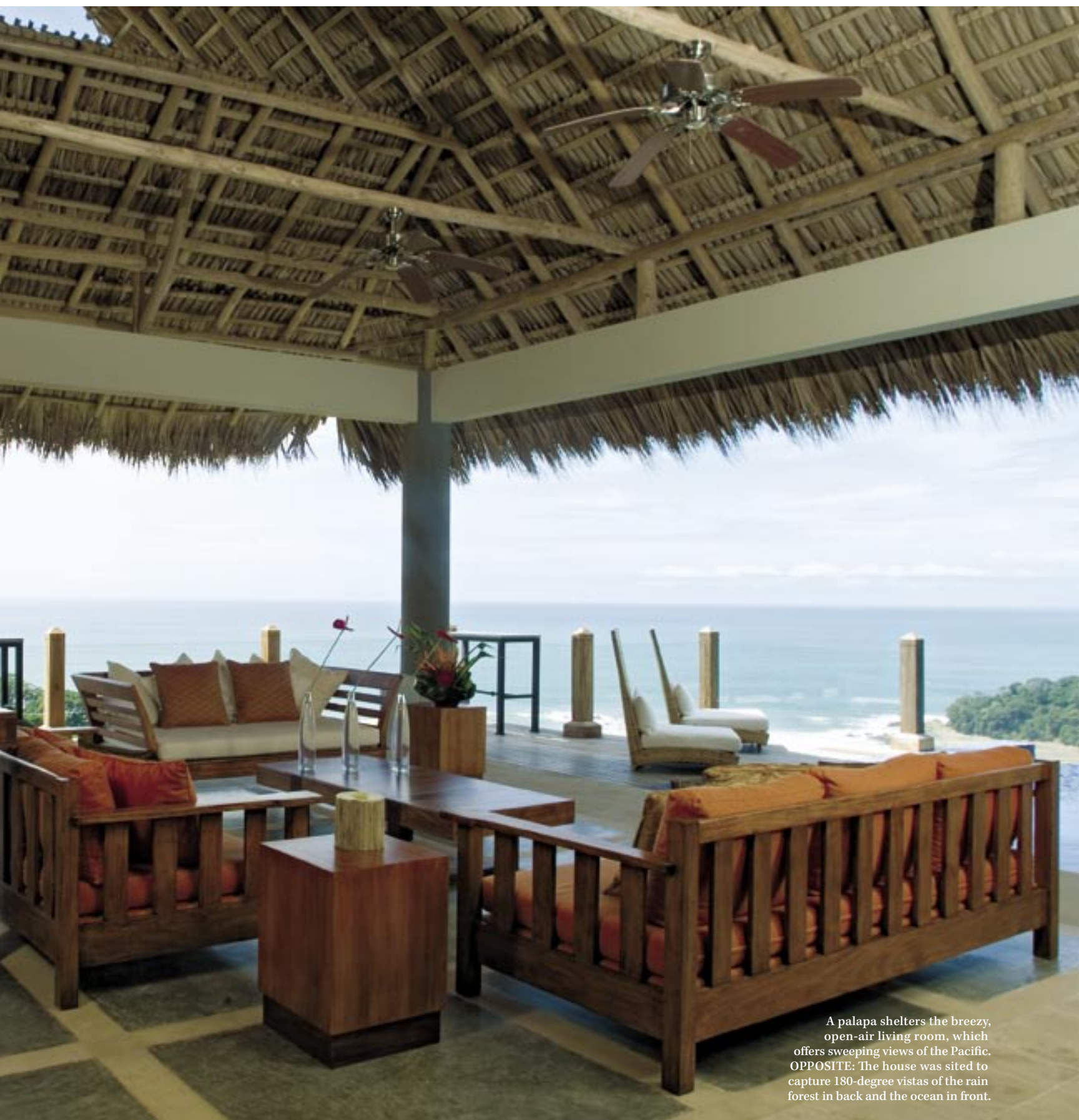
A palapa shelters the breezy, open-air living room, which offers sweeping views of the Pacific. OPPOSITE: The house was sited to capture 180-degree vistas of the rain forest in back and the ocean in front.